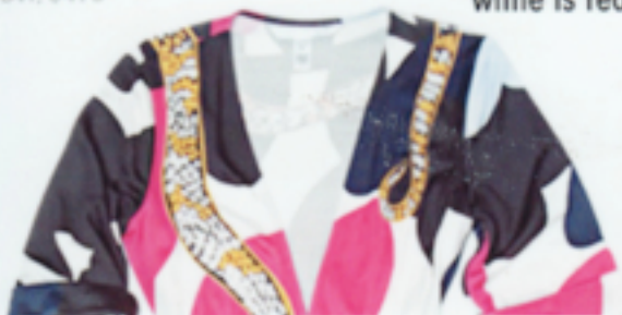
Aggie Silk Jersey Dress DVF, $345