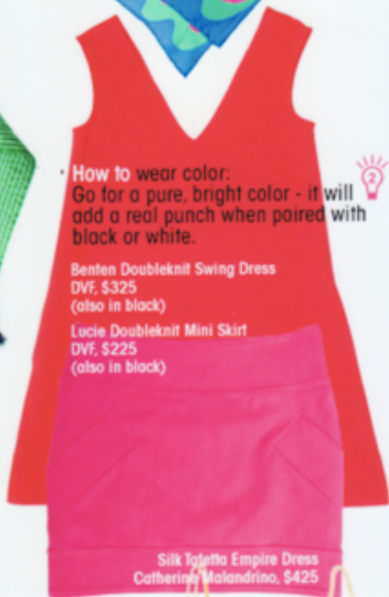
Lucie Doubleknit Mini Skirt DVF, $225 (also in black)