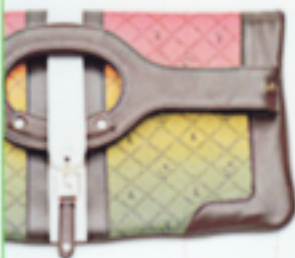
Carlisle Large Foldover Clutch L.A.M.B., $395